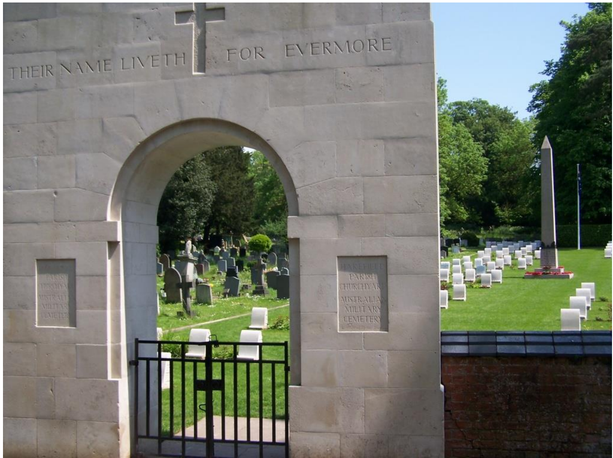
St. Mary the Virgin Churchyard, Harefield