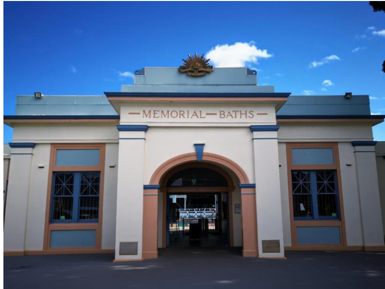
Lismore Memorial Baths