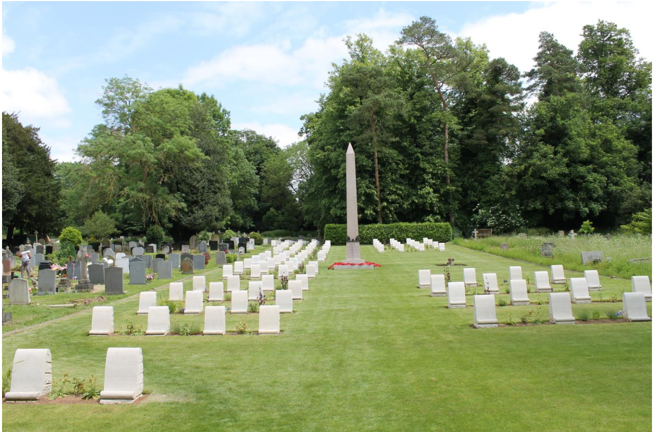
St. Mary the Virgin Churchyard, Harefield