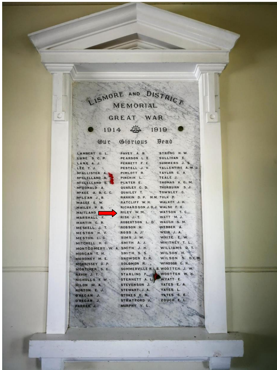
Lismore Memorial Baths WW1 Honour Board