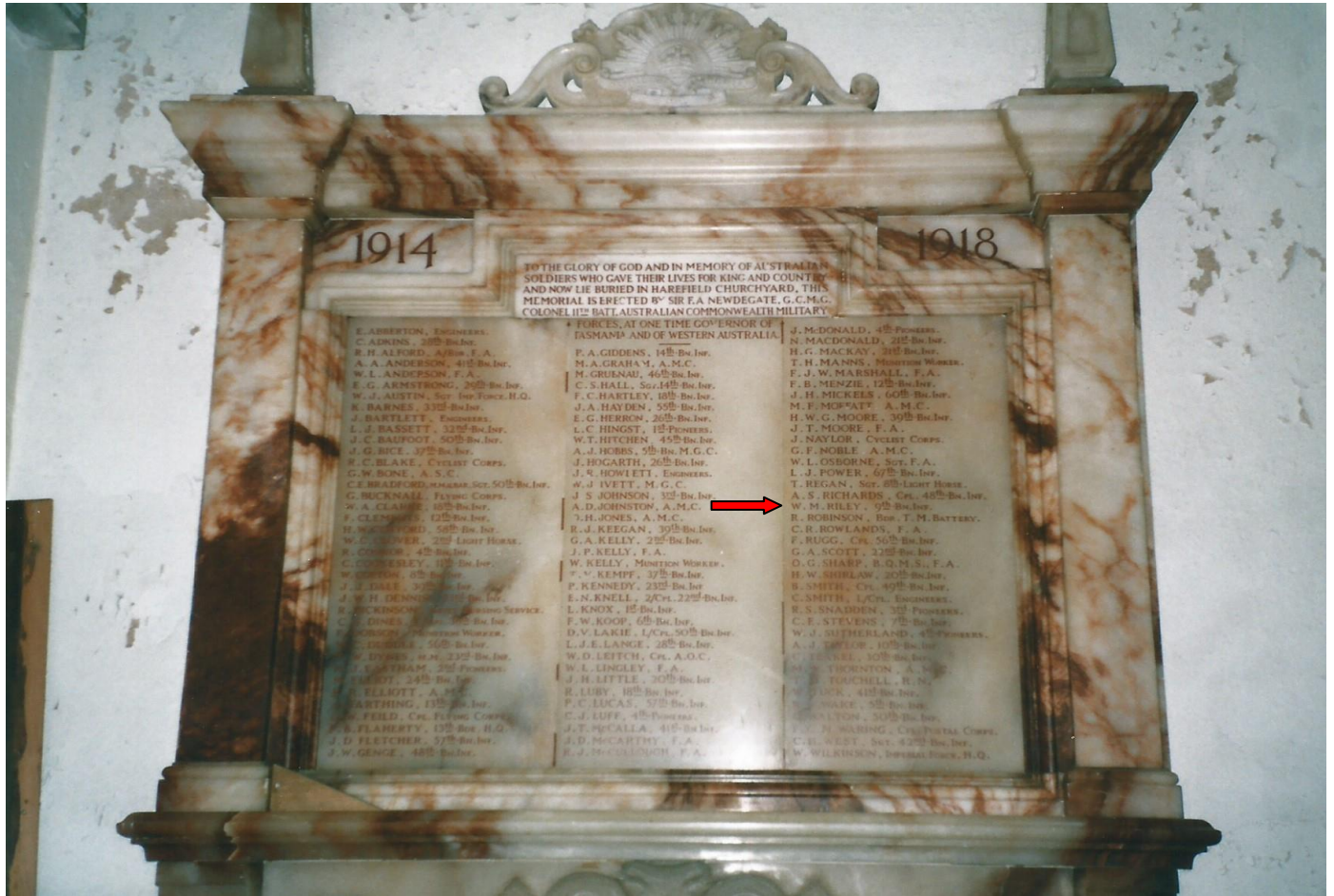
Australian Soldiers' Memorial, Harefield