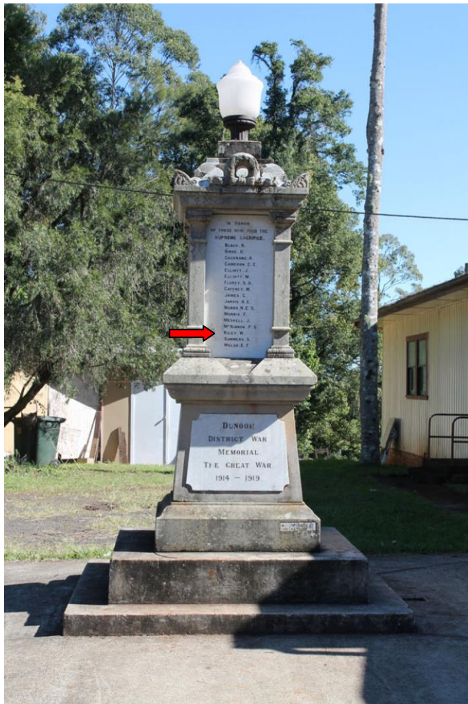
Dunoon District War Memorial