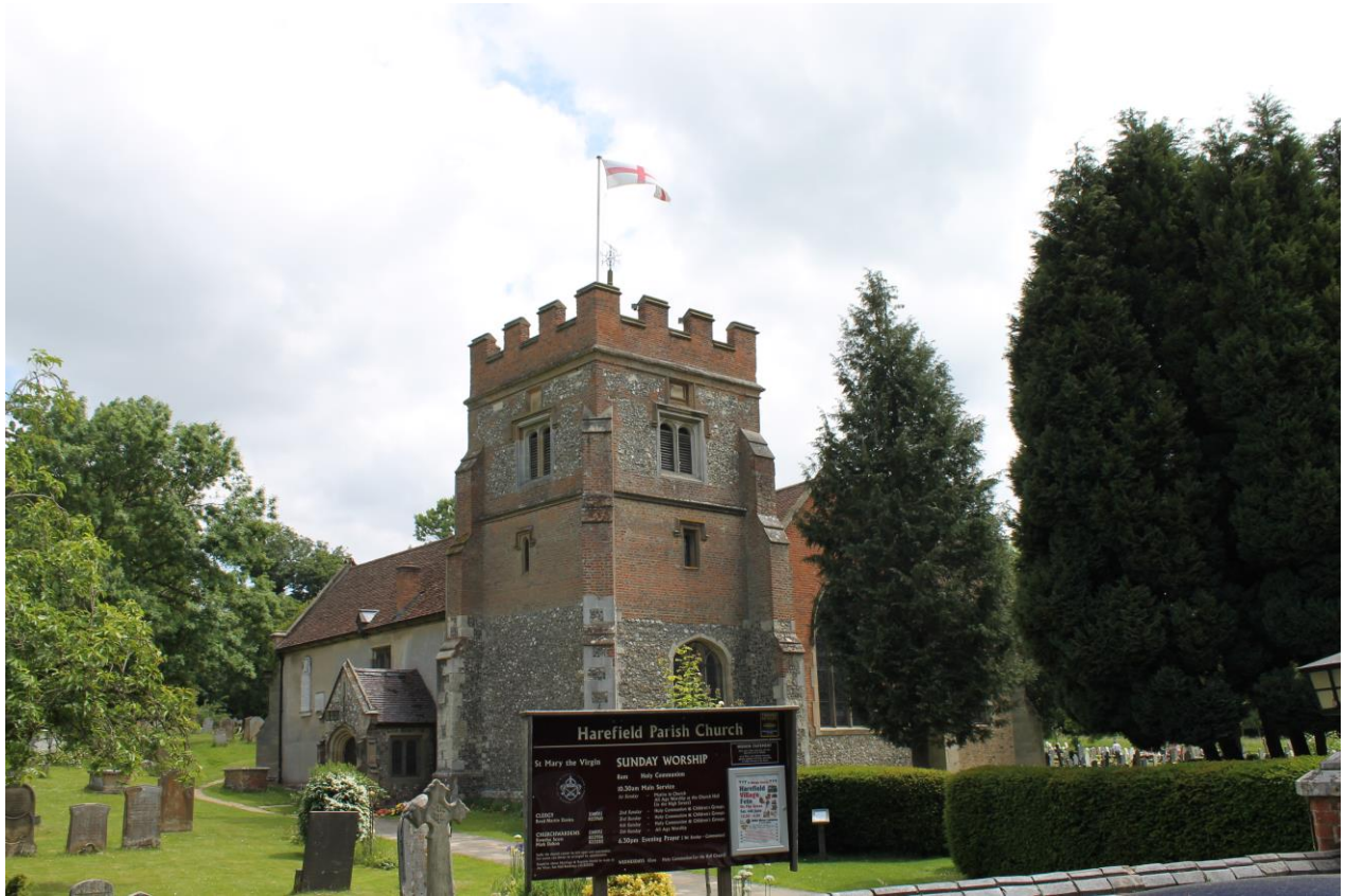
St Mary the Virgin Church, Harefield